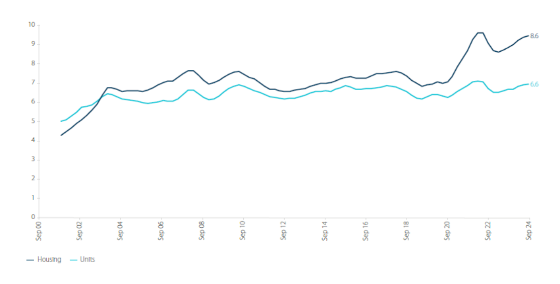
FIGURE 3: VALUE TO INCOME RATIO - HOUSES VS UNITS, NATIONAL